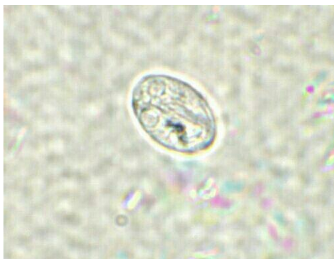
Figure 2: Cyst of Giardia spp. (100% immersion lens) using Iodine.

In sheep: Out of 120 fecal samples, 80 samples were positive to the infection according to the direct examination with normal saline (10%) and Iodine 80 (66.66%) and the negative to infection 40 (33.33%).